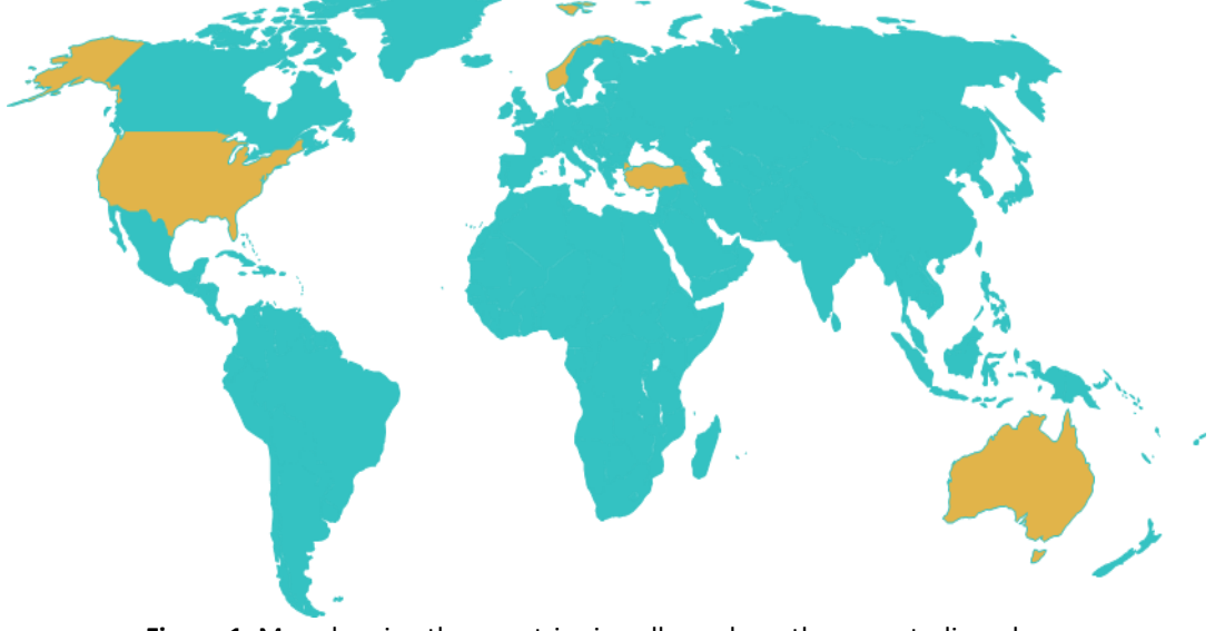
Figure 1: Map showing the countries in yellow where the case studies where carried out

Based on the reviewed case studies, we noticed that Lean philosophy is still not adopted widely and it's limited to projects that were considered mega sized and when investors ask for Lean to be used. However, as shown in the map in Figure 1 below, the reviewed projects are also distributed around the world, which shows a big interest in such technology.